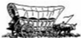
OTOE COUNTY GENEALOGICAL SOCIETY

Please email bedding@unionne.org or call 402-843-1111 for more information.